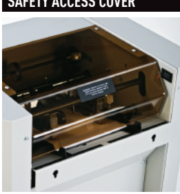
The transparent safety access cover will not allow machine to operate when open.