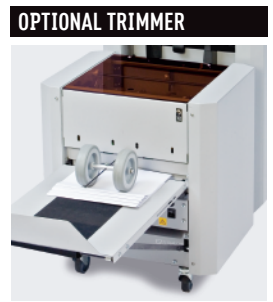
An optional face trimmer trims booklets up to 100 pages.*