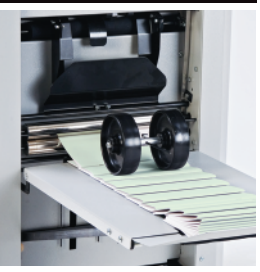
A powered exit conveyor stacks booklets neatly and folds away for compact storage.